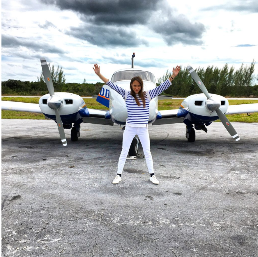
Boarding the plane in Nassau to go to Harbour Island.

And then in terms of other art projects, I am trying to do more events and curated studio visits for collectors and smaller groups of people, which I want to put online so everyone can have a peek. I'm looking forward to the next "Studio Visit of the Month" as they're called. It's a video series I do for artists I work with, featuring their spaces. The next one will hopefully happen in the fall at some point, when I lock down the time.